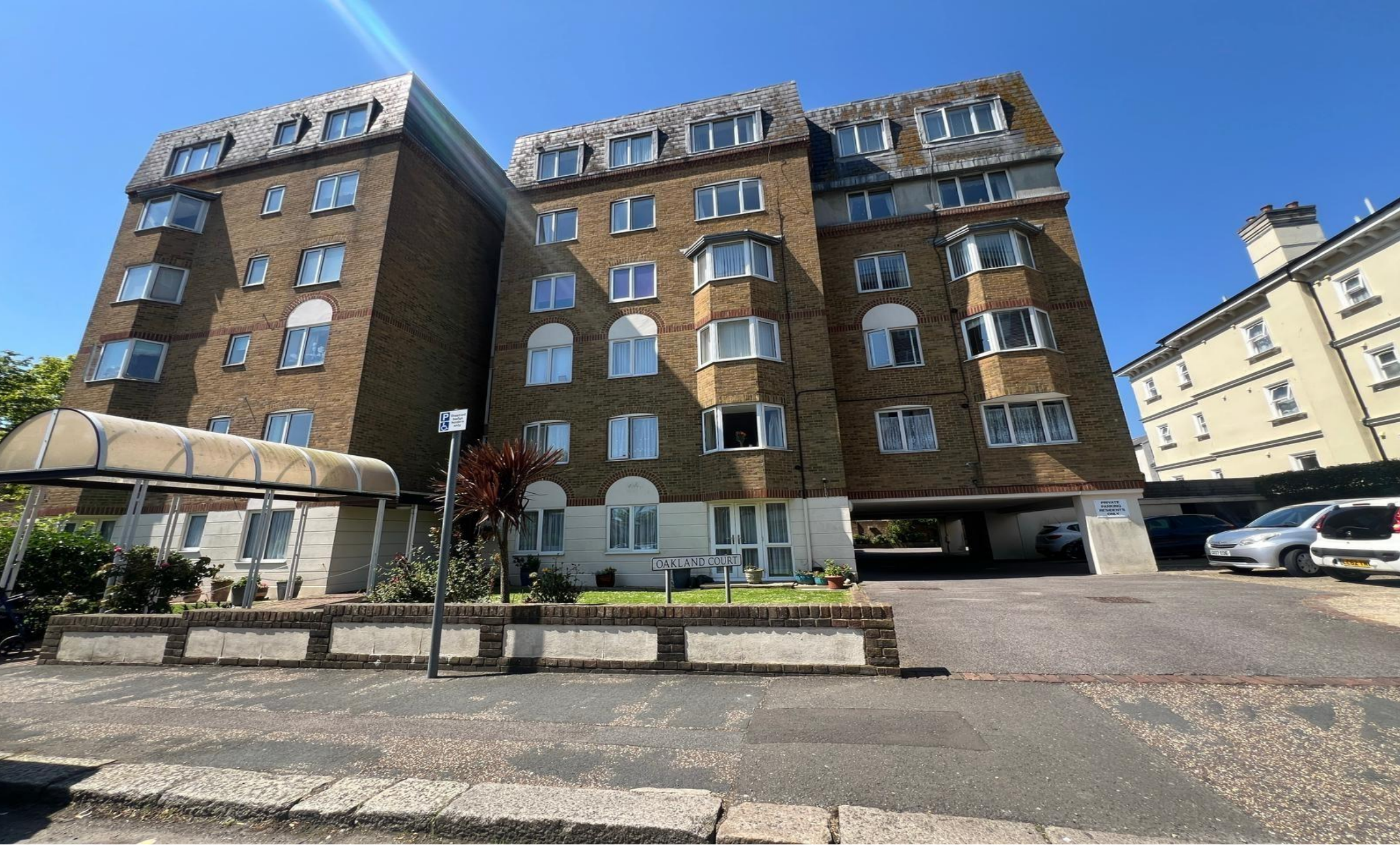
Oakland Court Gratwicke Road, Worthing BN11 4BZ