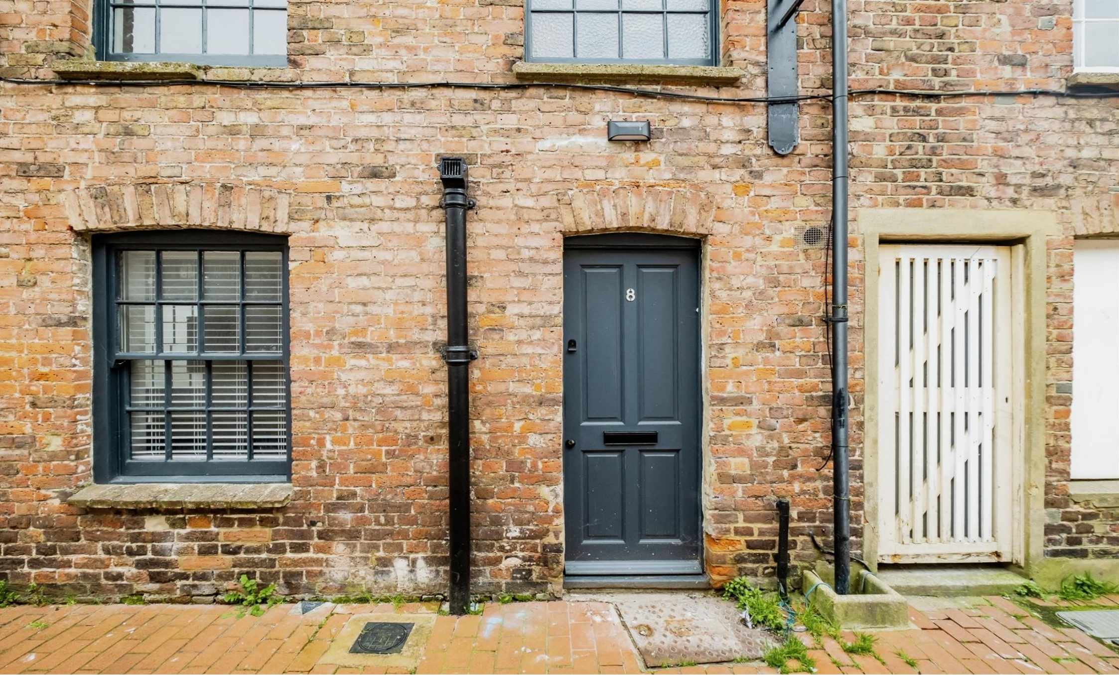
Field Row, Worthing BN11 1TD