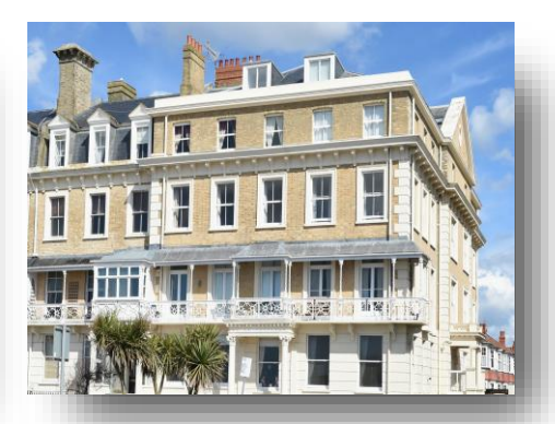
Heene Terrace Marine Parade Map data ©2024