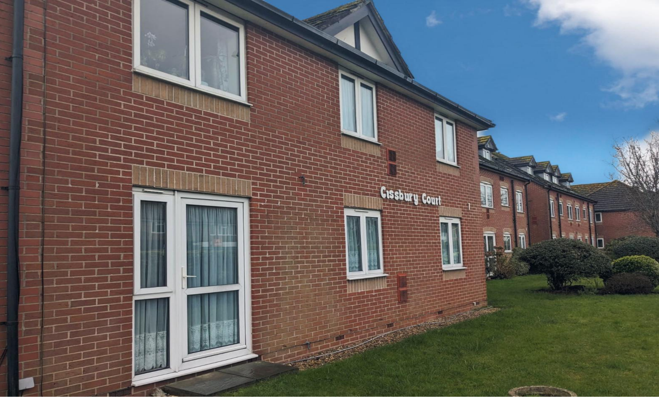
Cissbury Court, Findon Road, Worthing BN14 0BF