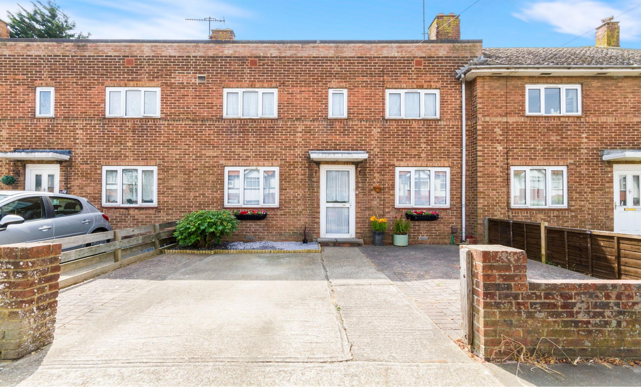
Meadow Road, Worthing BN11 2SJ