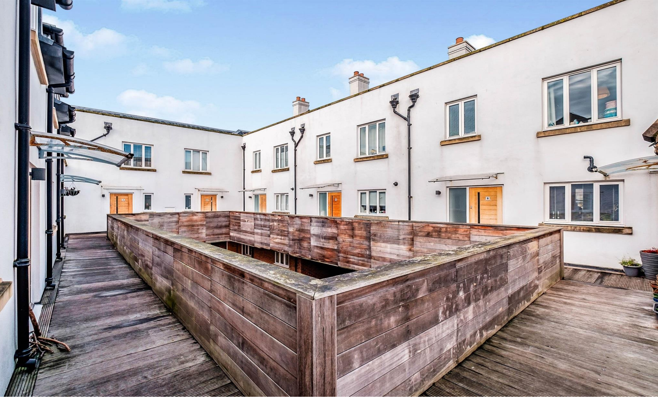
Spells Yard Grafton Place, WORTHING BN11 1AR