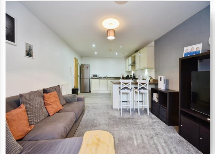
Trafford Apartments Richmond Way, Rotherham S61 2LJ