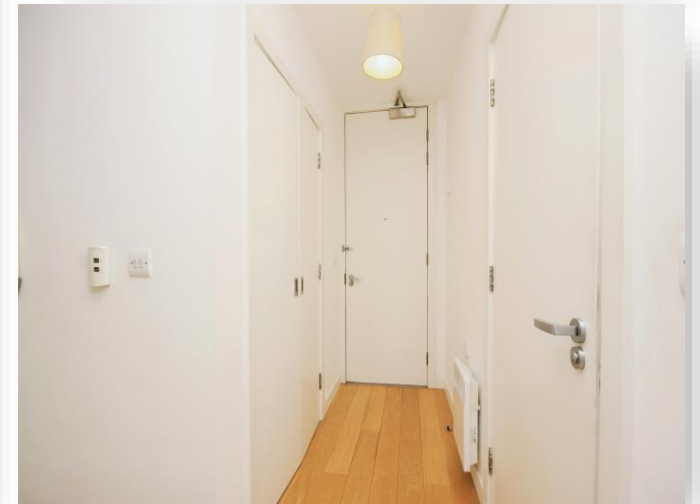
The Old Market Market Street, Rotherham Town Centre Rotherham S60 1NR