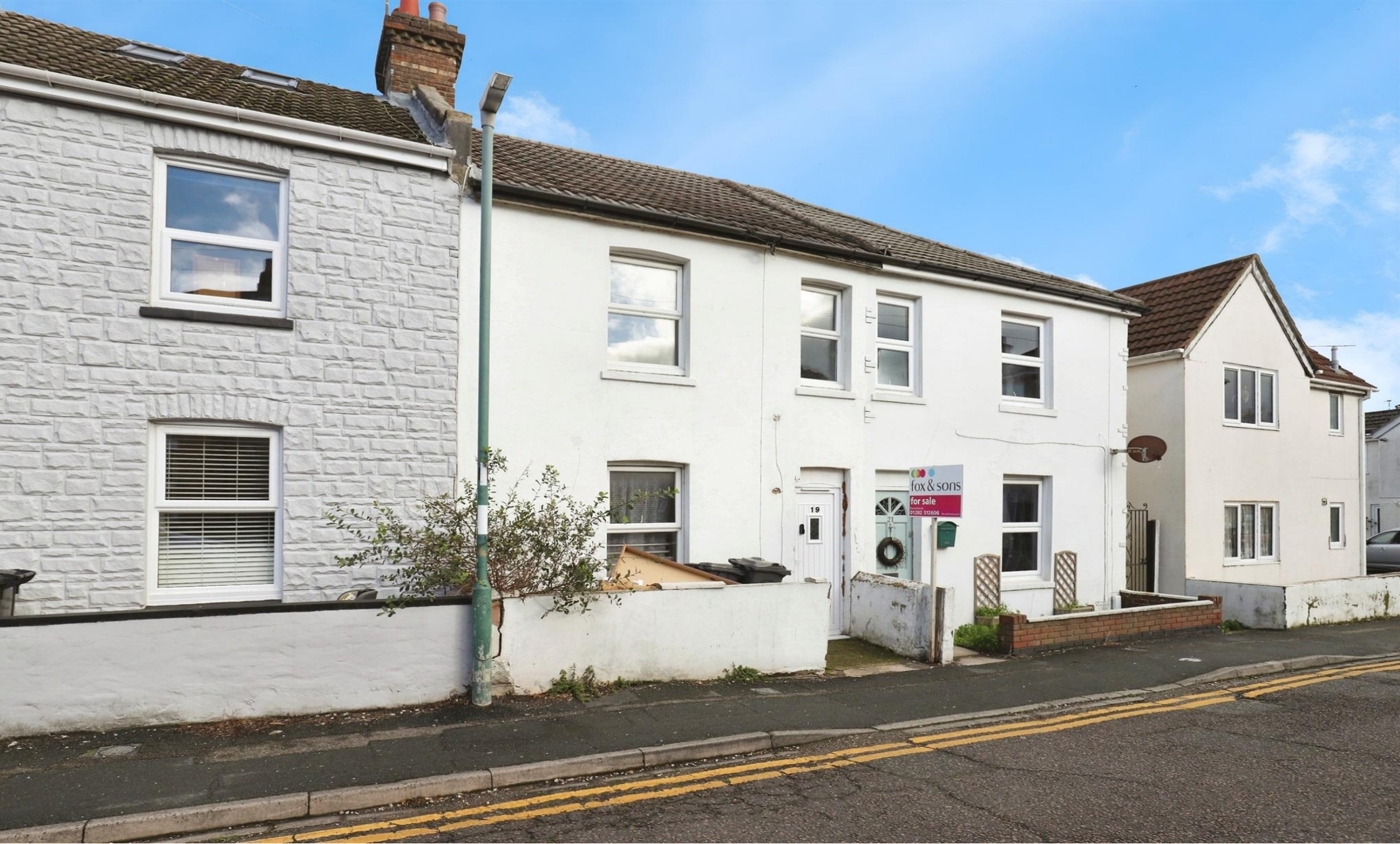
Victoria Place, Bournemouth BH1 4SA