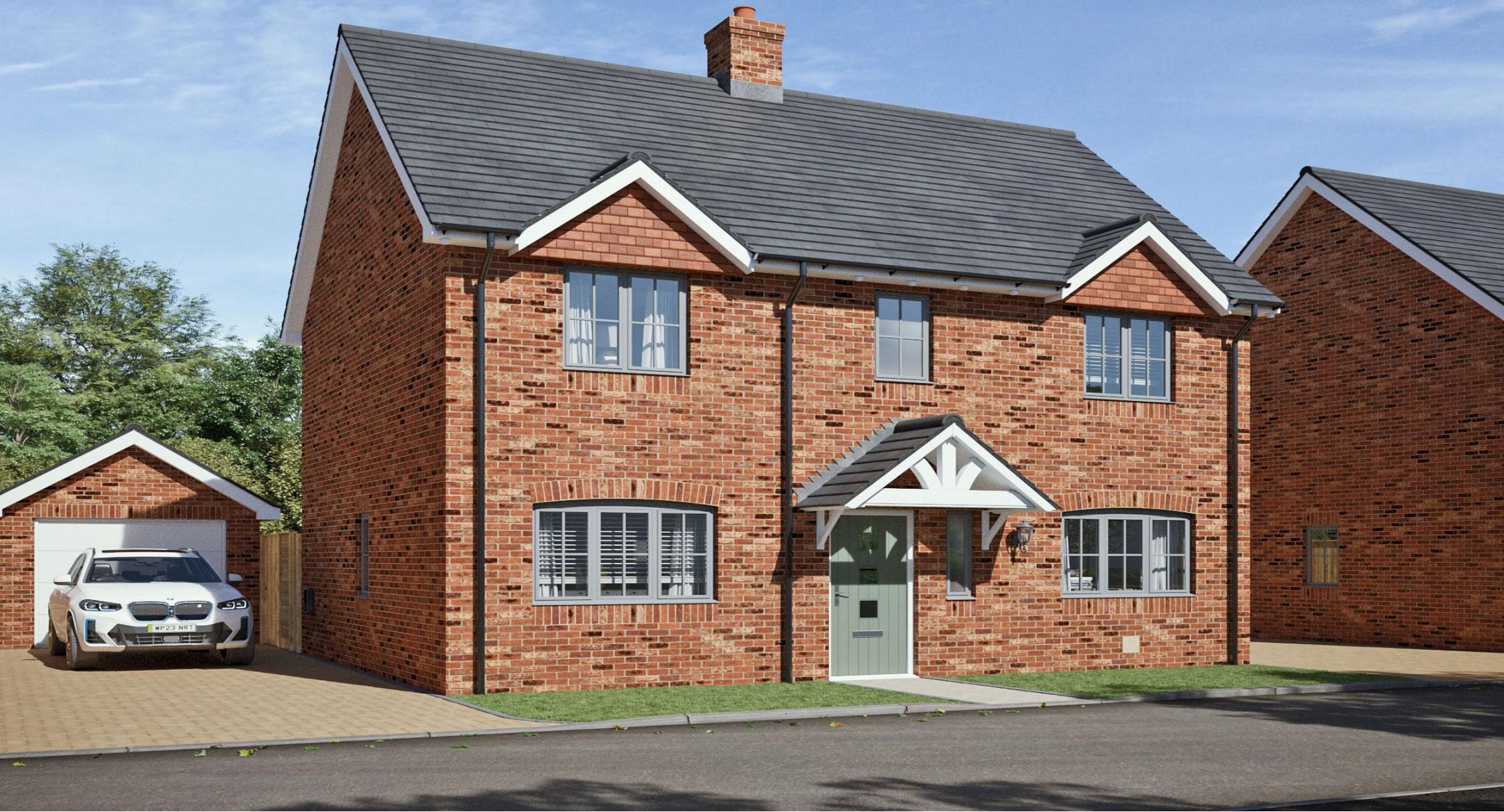
The Anderbury Brockhills Lane, New Milton BH25 5QL