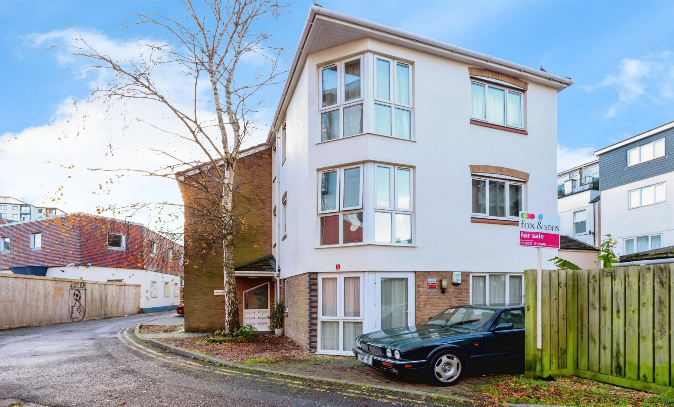
Sybil House Lansdowne Mews, BOURNEMOUTH BH1 1SJ