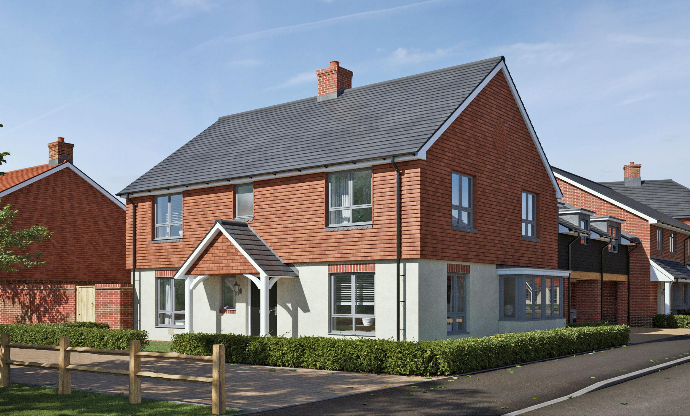
The Daneswood Brockhills Lane, New Milton BH25 5QL