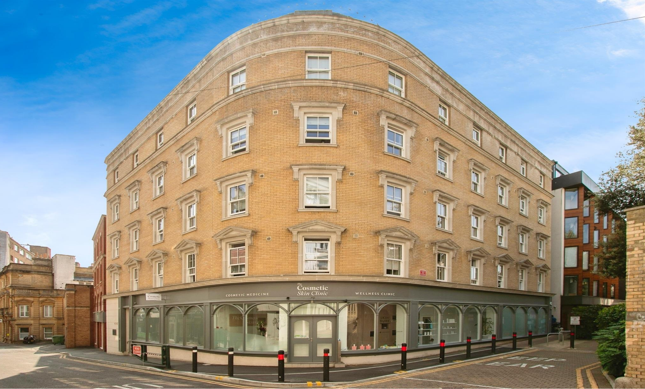
The Old Sorting Office Albert Road, BOURNEMOUTH BH1 1AX