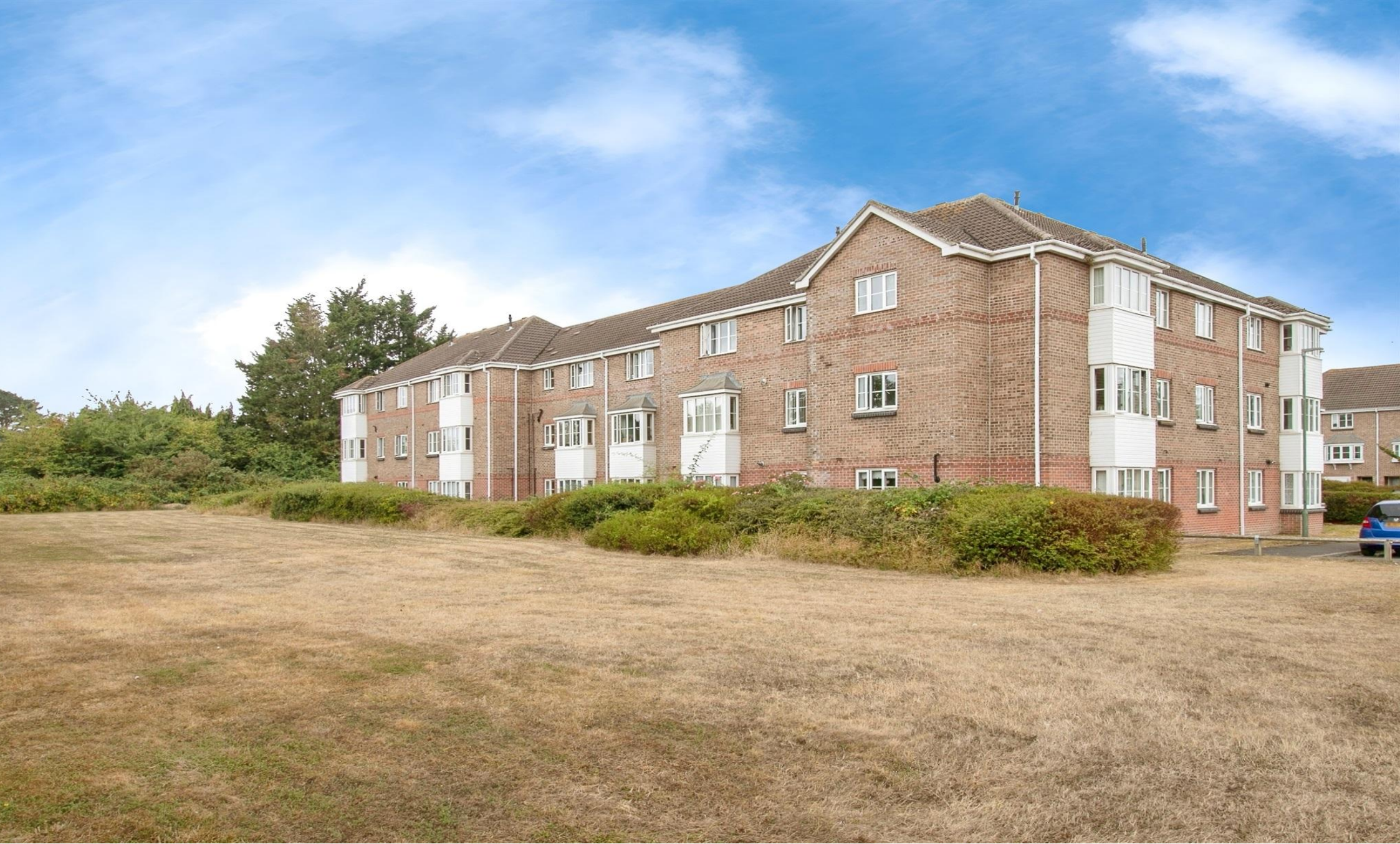
Goldenleas Court Goldenleas Drive, Bournemouth BH11 8TG