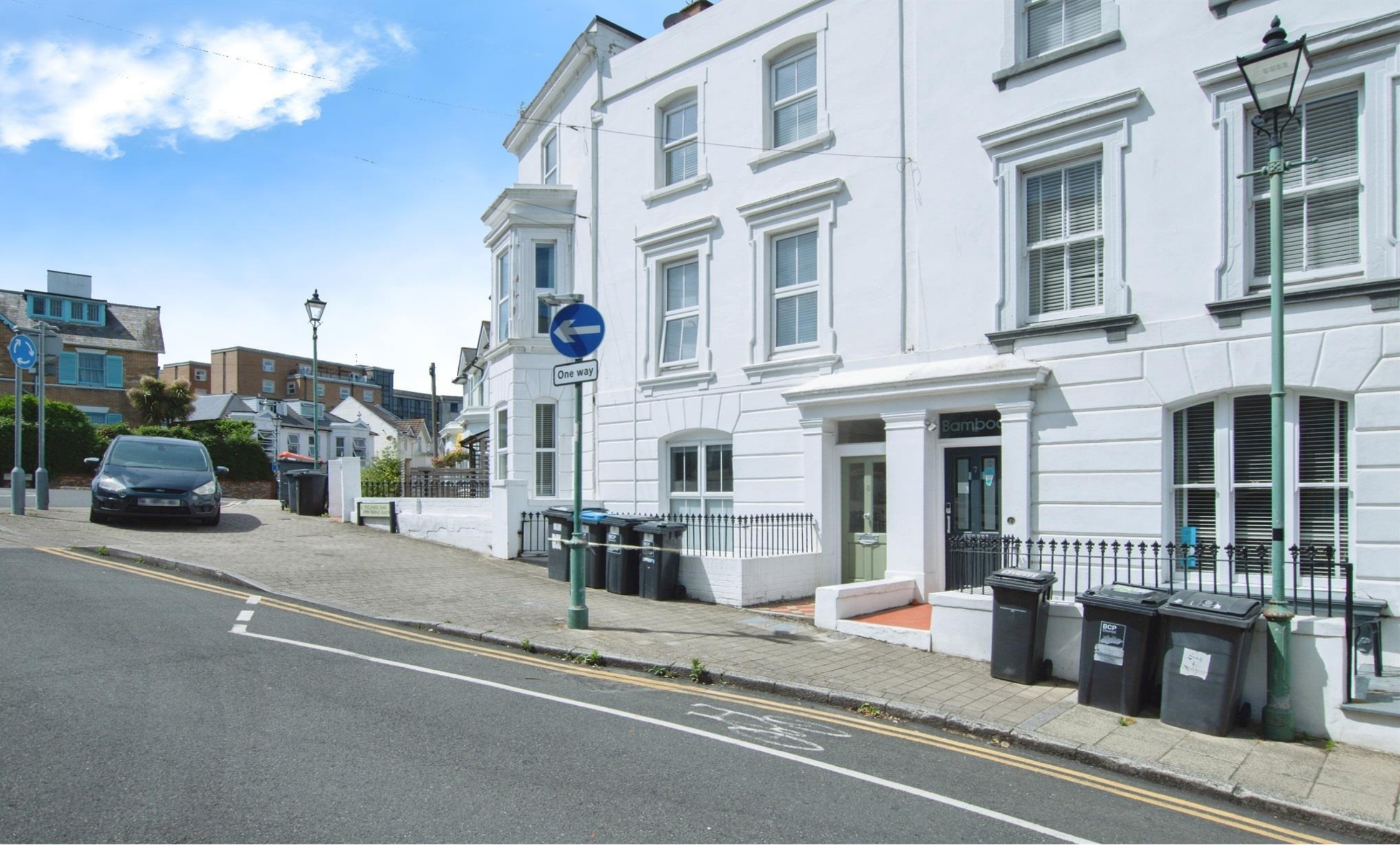
Upper Terrace Road,BOURNEMOUTH BH2 5NW