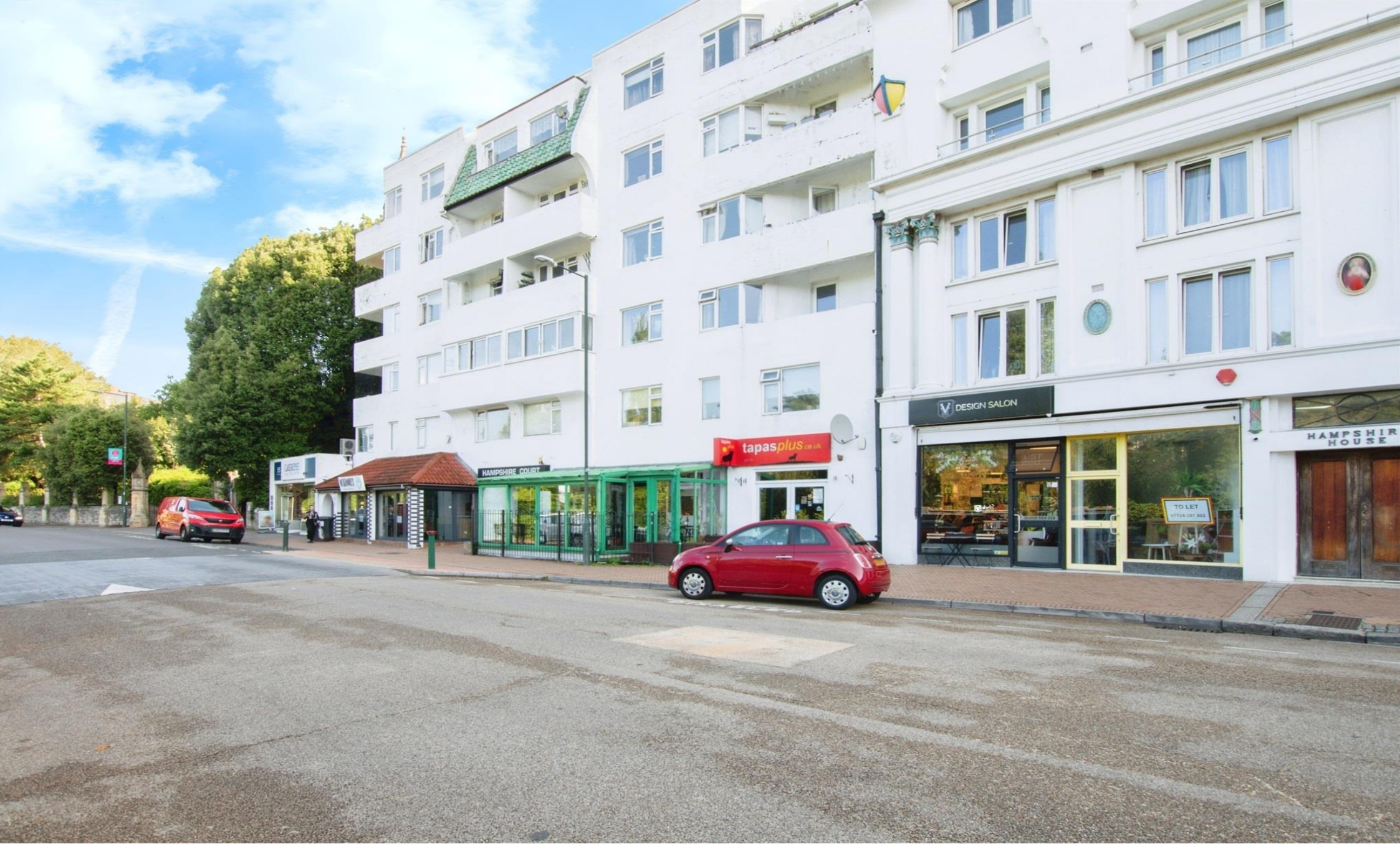
Hampshire Court. Bourne Avenue, Bournemouth BH2 6DW