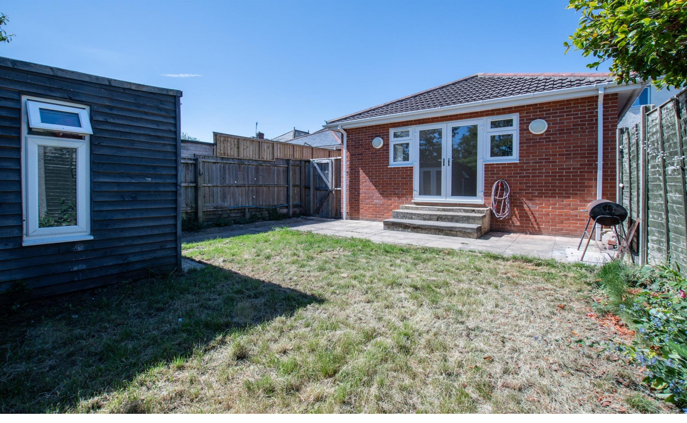
Edgehill Road, Bournemouth BH9 2PD