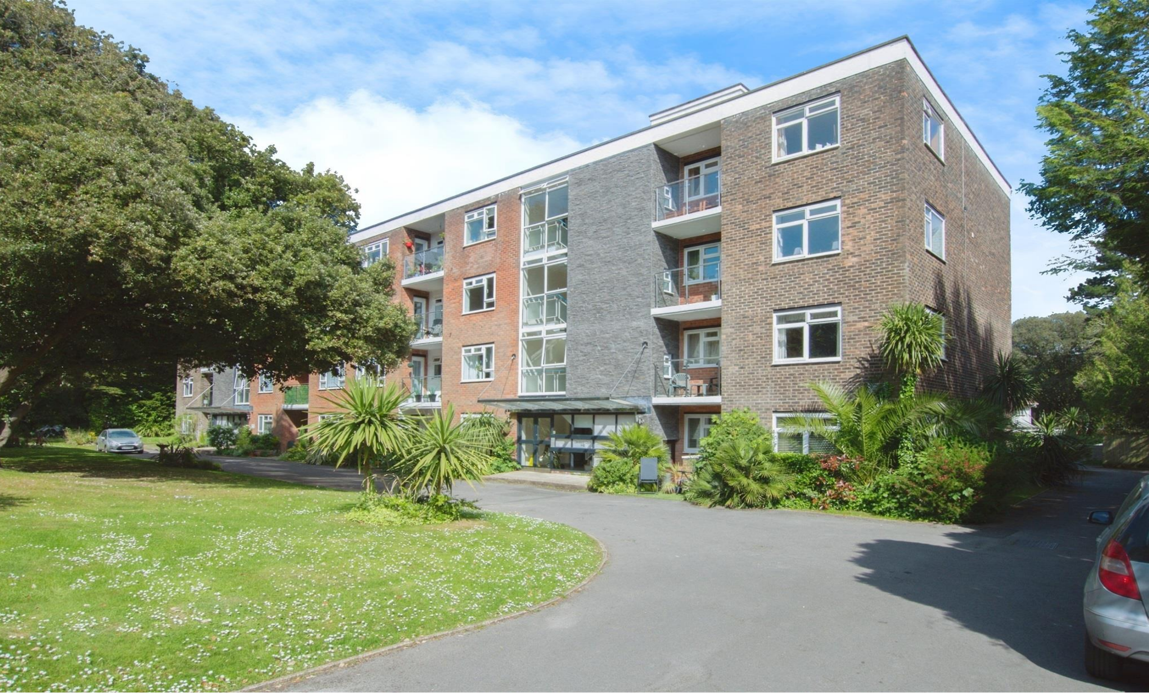
Cleveland Court Chine Crescent Road, Bournemouth BH2 5LG