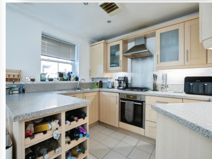
The Pines Knyveton Road, Bournemouth BH1 3QL