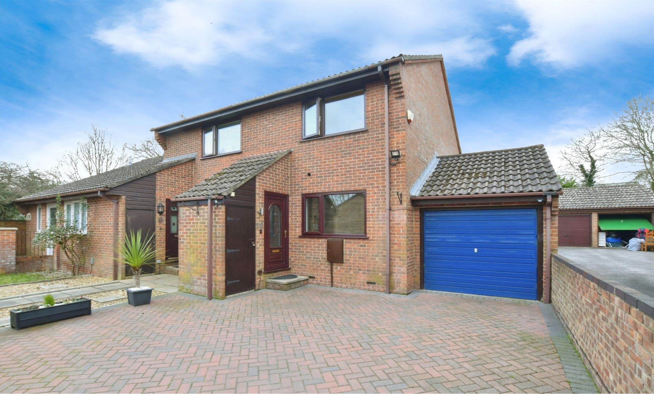
Fryer Close, Bournemouth BH11 8AP