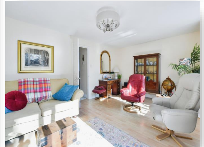
Boveridge Gardens, Bournemouth BH9 3RF