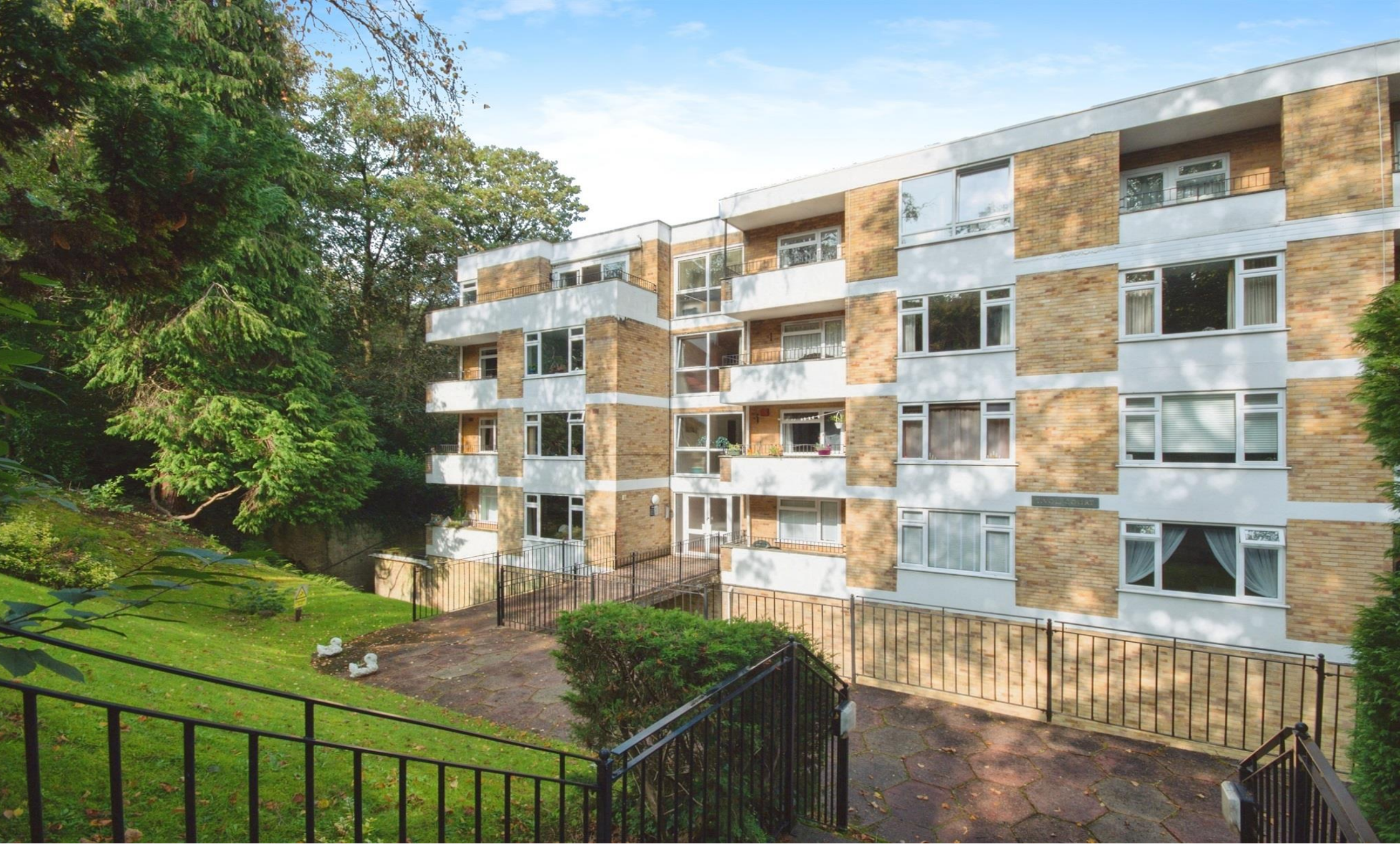
Tivoli Court Surrey Road, Bournemouth BH4 9HU