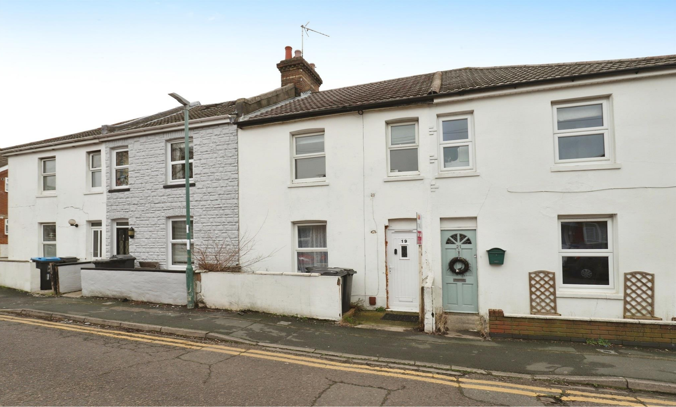
Victoria Place, Bournemouth BH1 4SA