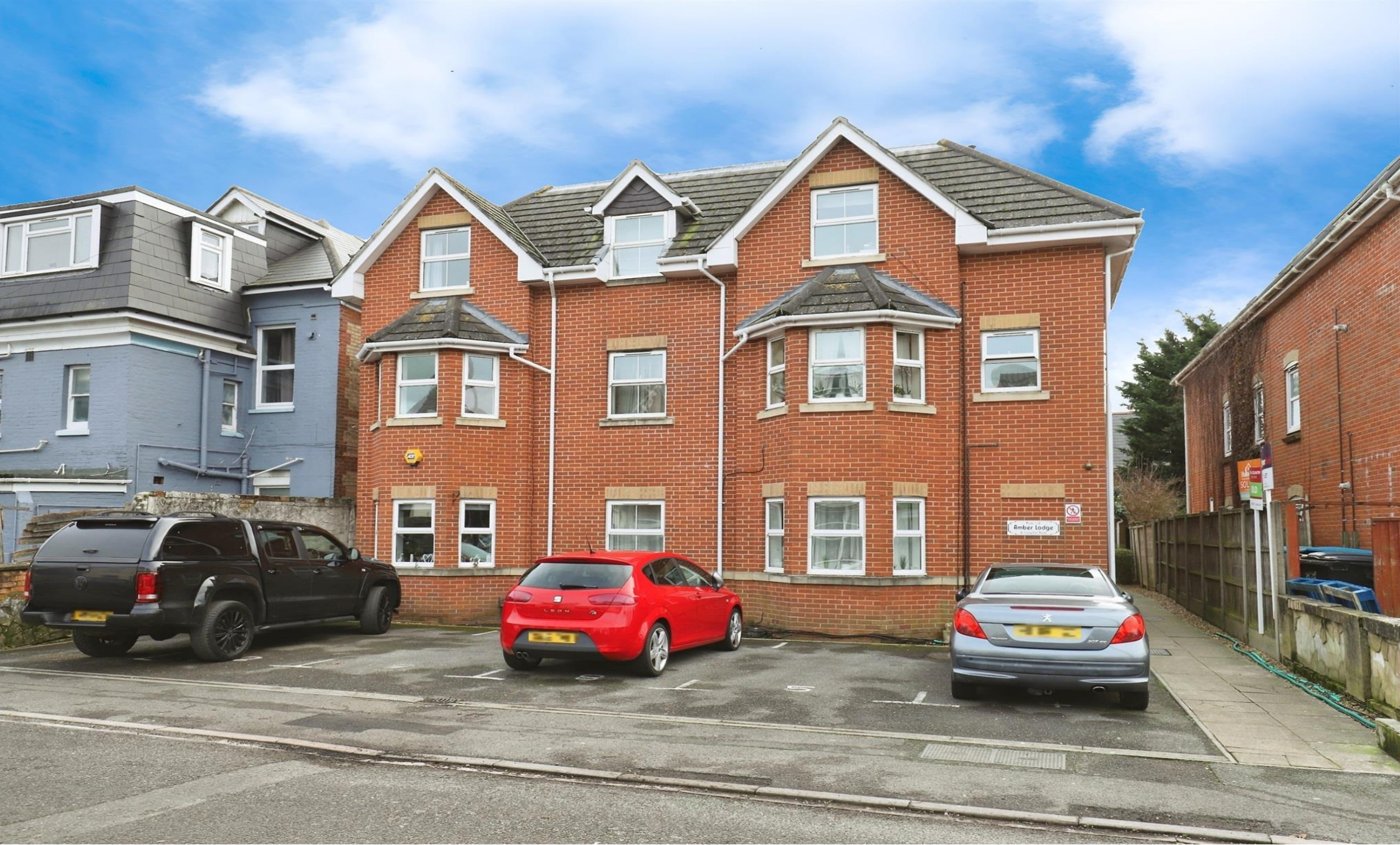
Amber Lodge Carysfort Road, Bournemouth BH1 4EJ