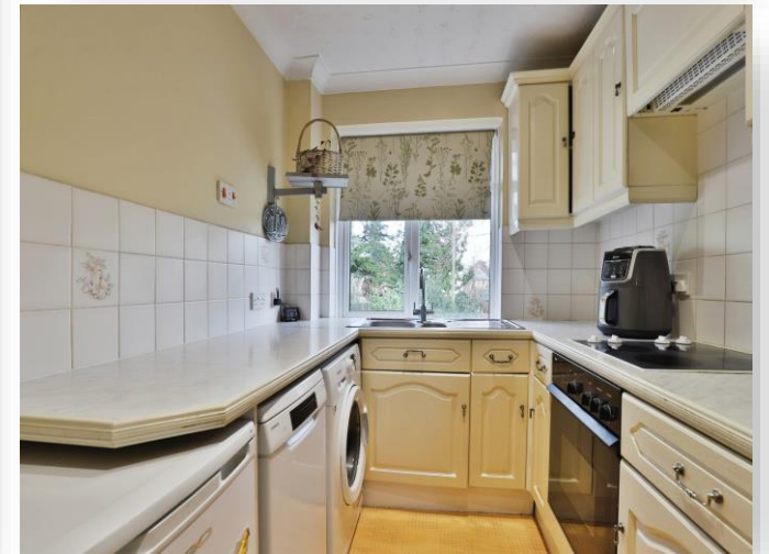
Barrington Court Talbot Avenue, Bournemouth BH3 7HT