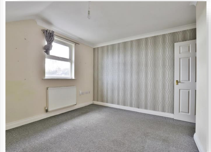
Shannon Court Castlemain Avenue, Bournemouth BH6 5EH