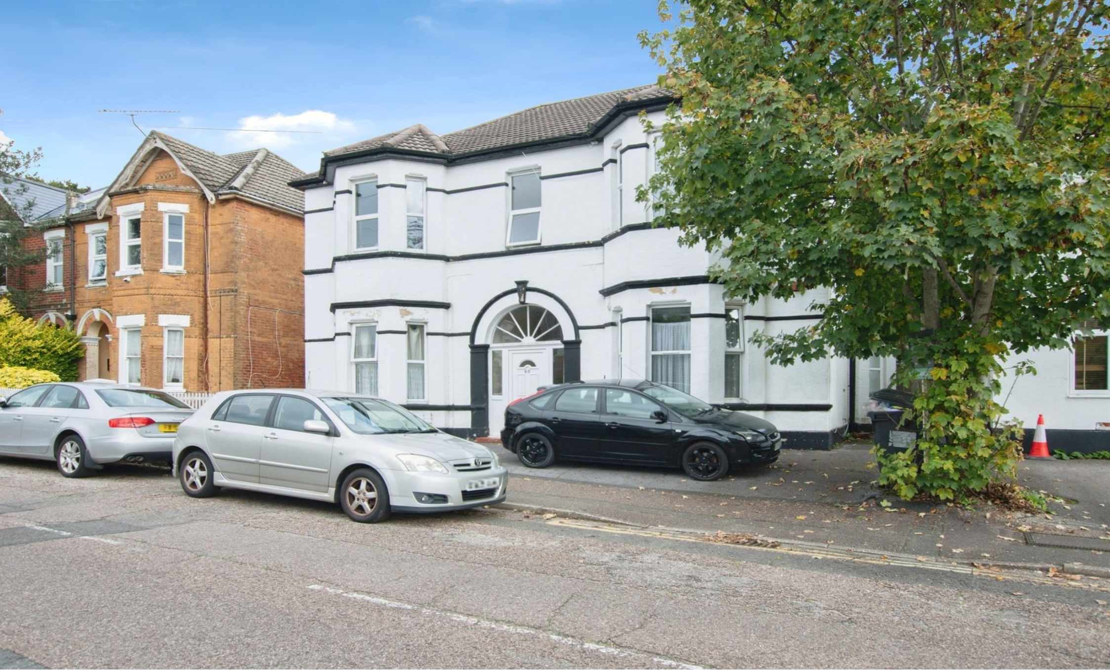
Drummond Road, Bournemouth BH1 4DT