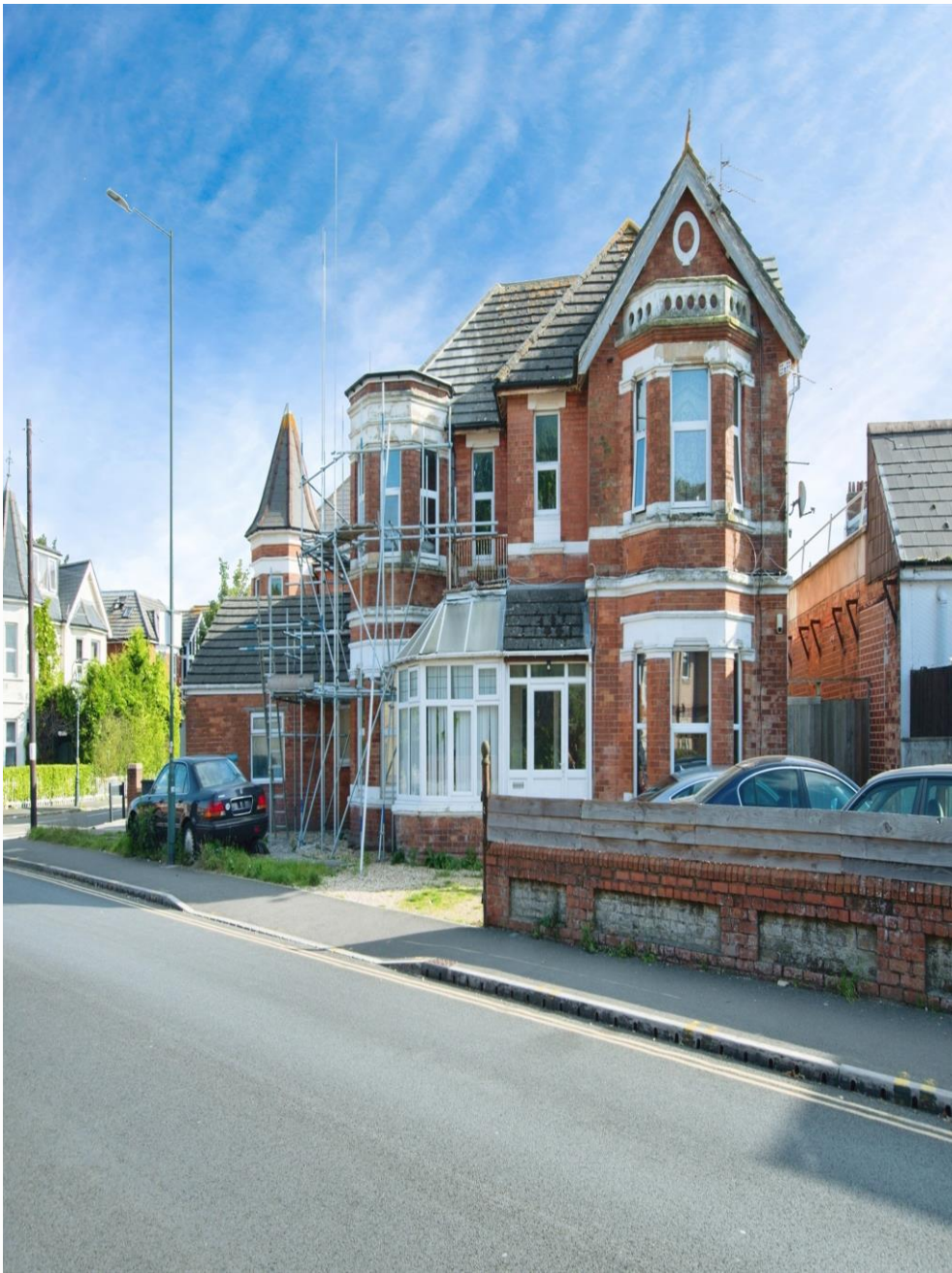
Heron Court Road, Bournemouth BH3 7LJ