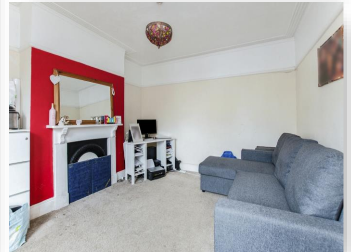
Parker Road, Bournemouth BH9 1AY