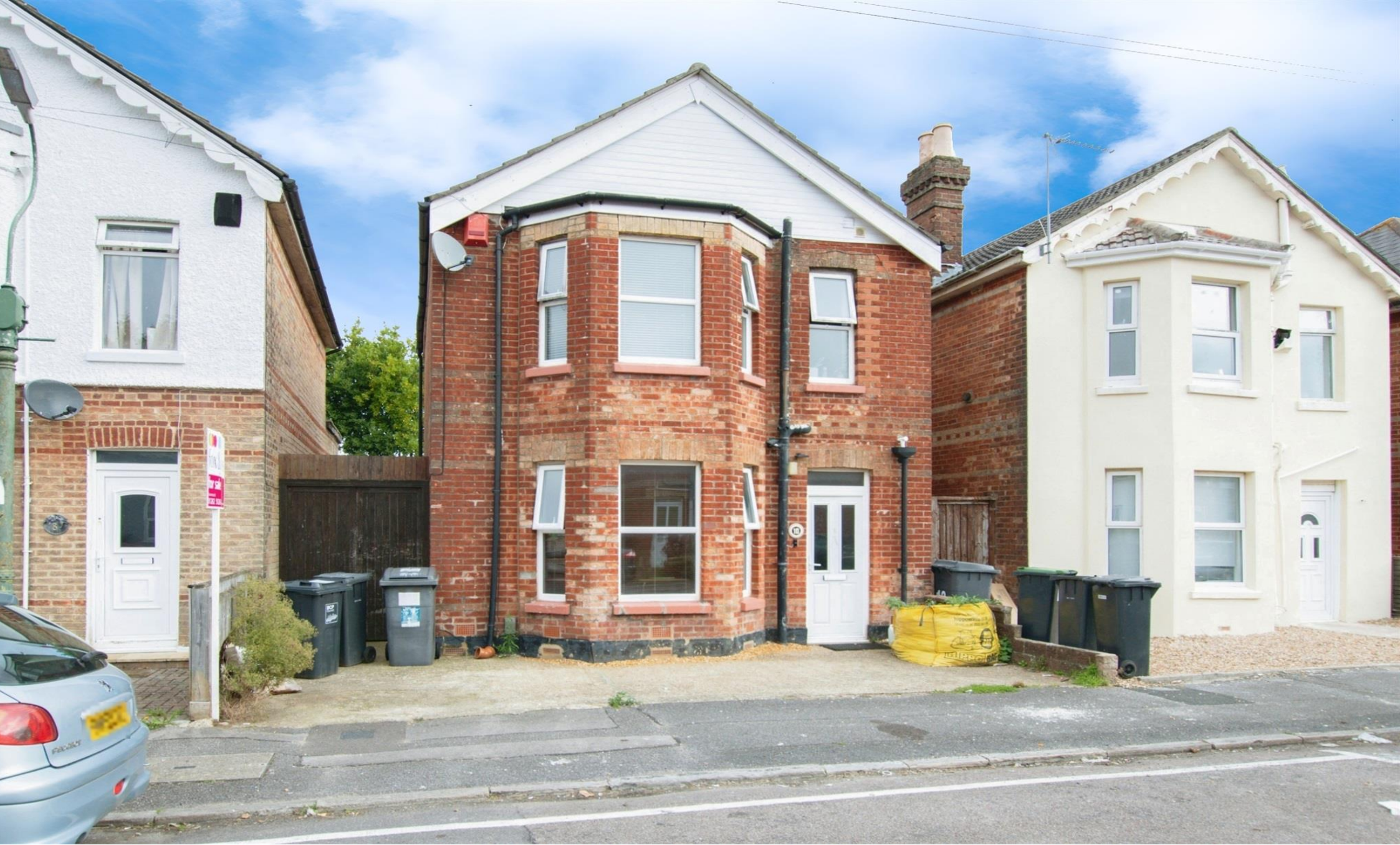
Parker Road, Bournemouth BH9 1AY