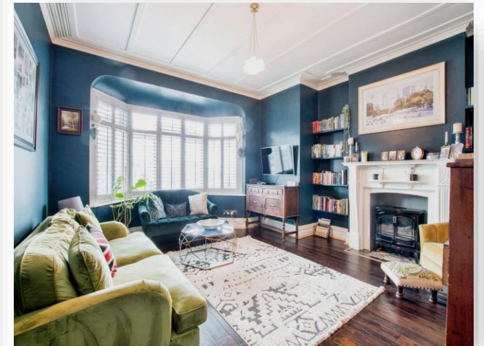
Richmond Wood Road, Bournemouth BH8 9DQ