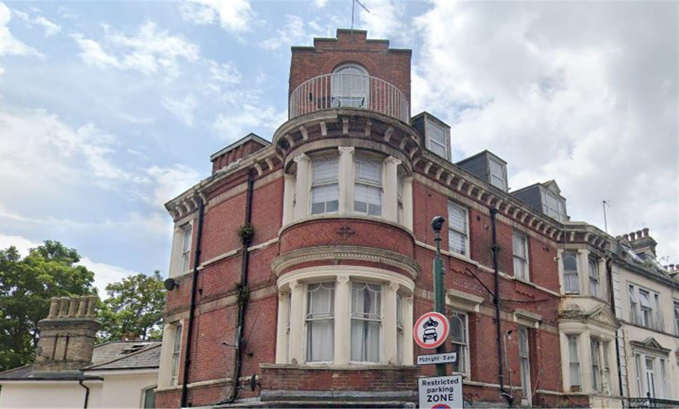
Glenfern Lodge Old Christchurch Road, Bournemouth BH1 1NU