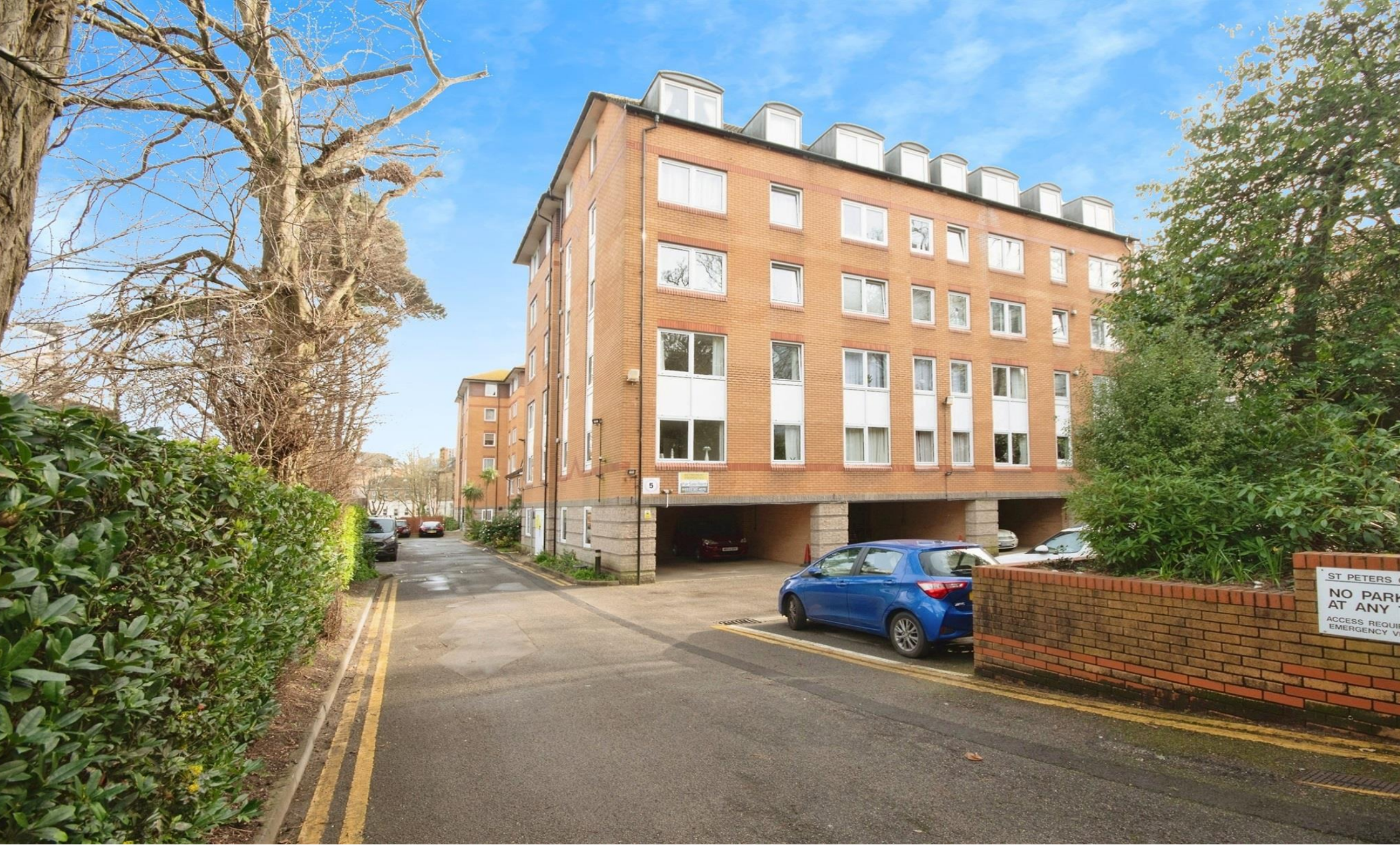
St. Peters Court St. Peters Road, Bournemouth BH1 2JU