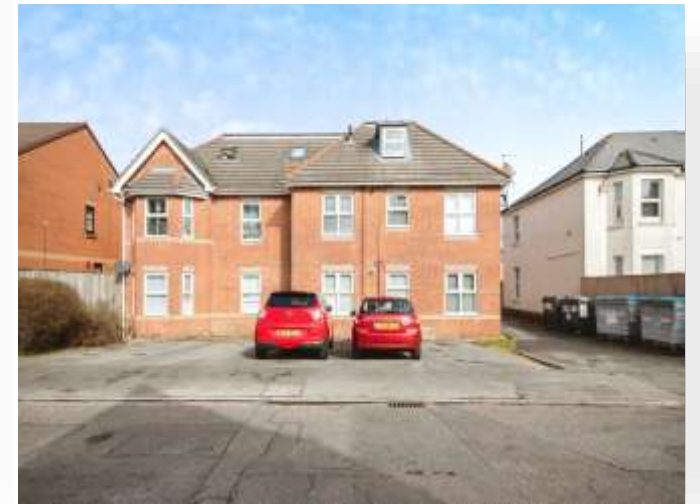
Malmesbury Mews Malmesbury Park Place, Bournemouth BH8 8FJ