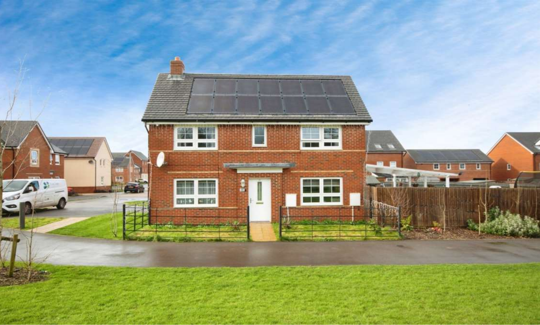
Thomas Walk, Bearwood Bournemouth BH11 9GD