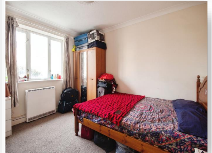
Meadow Court Wimborne Road, Bournemouth BH9 2BU