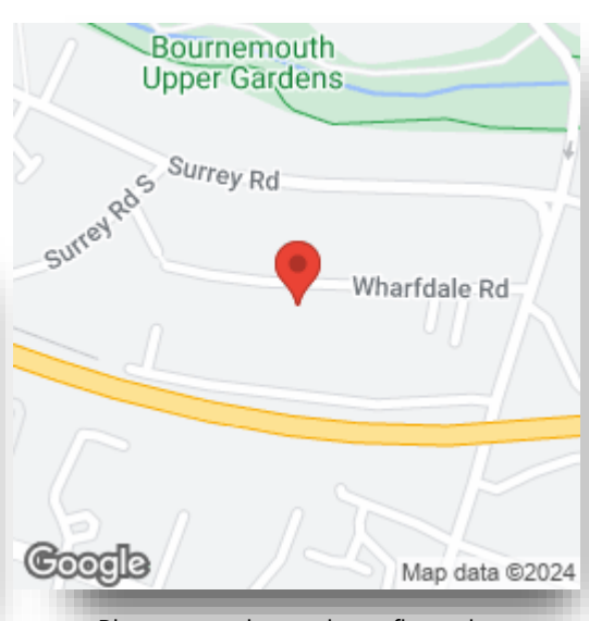
Please note the marker reflects the postcode not the actual property