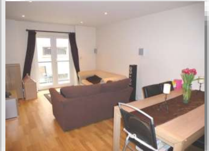
Commercial Road, Bournemouth BH2 5AT