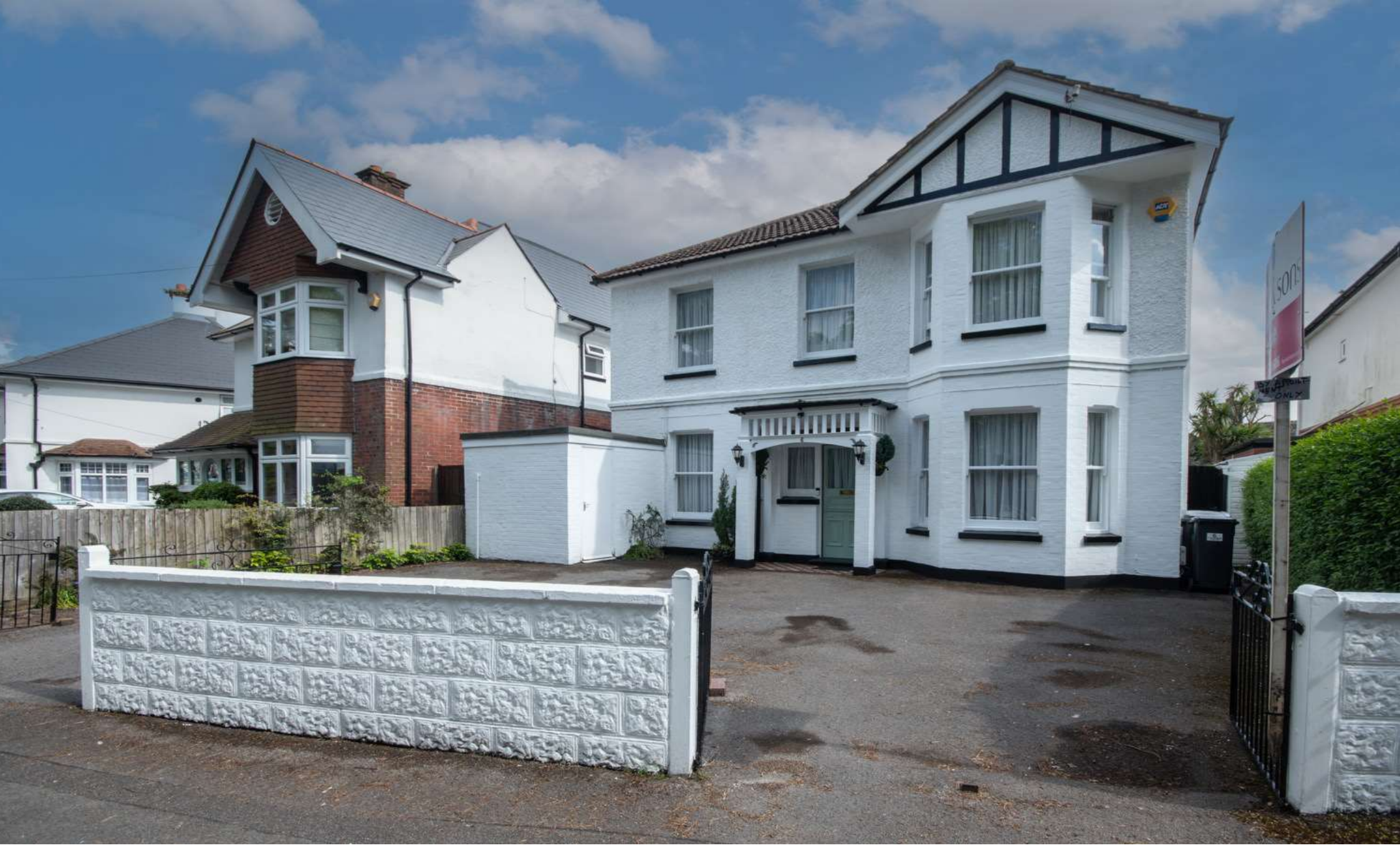
Fitzharris Avenue, Bournemouth BH9 1BZ