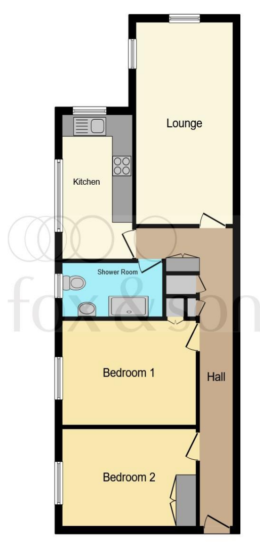
Total floor area 65.6 sq.m. (706 sq.ft.) approx

This floorplan is for illustrative purposes only and is not drawn to scale. Measurements, floor-areas, openings and orientations are approximate. They should not be relied upon for any purpose and do not form any part of an agreement. No liability is taken for any error or mis-statement. All parties must rely on their own inspections.