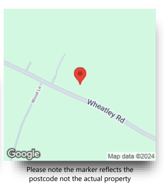
view this property online williamhbrown.co.uk/Property/RFD108766