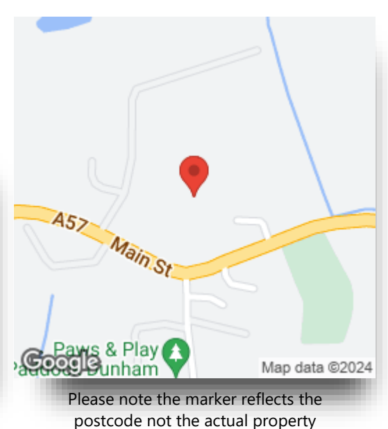
view this property online williamhbrown.co.uk/Property/RFD109180