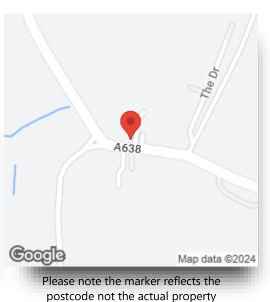
view this property online williamhbrown.co.uk/Property/RFD107665