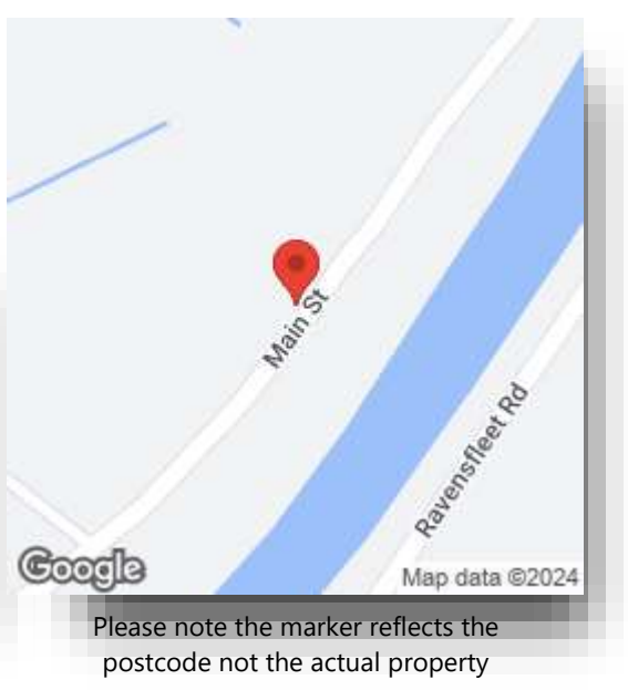
view this property online williamhbrown.co.uk/Property/RFD108568