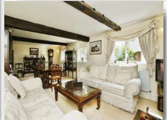
Meadow Cottage Low Holland Lane, Sturton-Le-Steeple Retford DN22 9HH