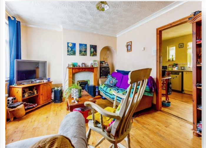
Park Avenue, Raunds Wellingborough NN9 6NA