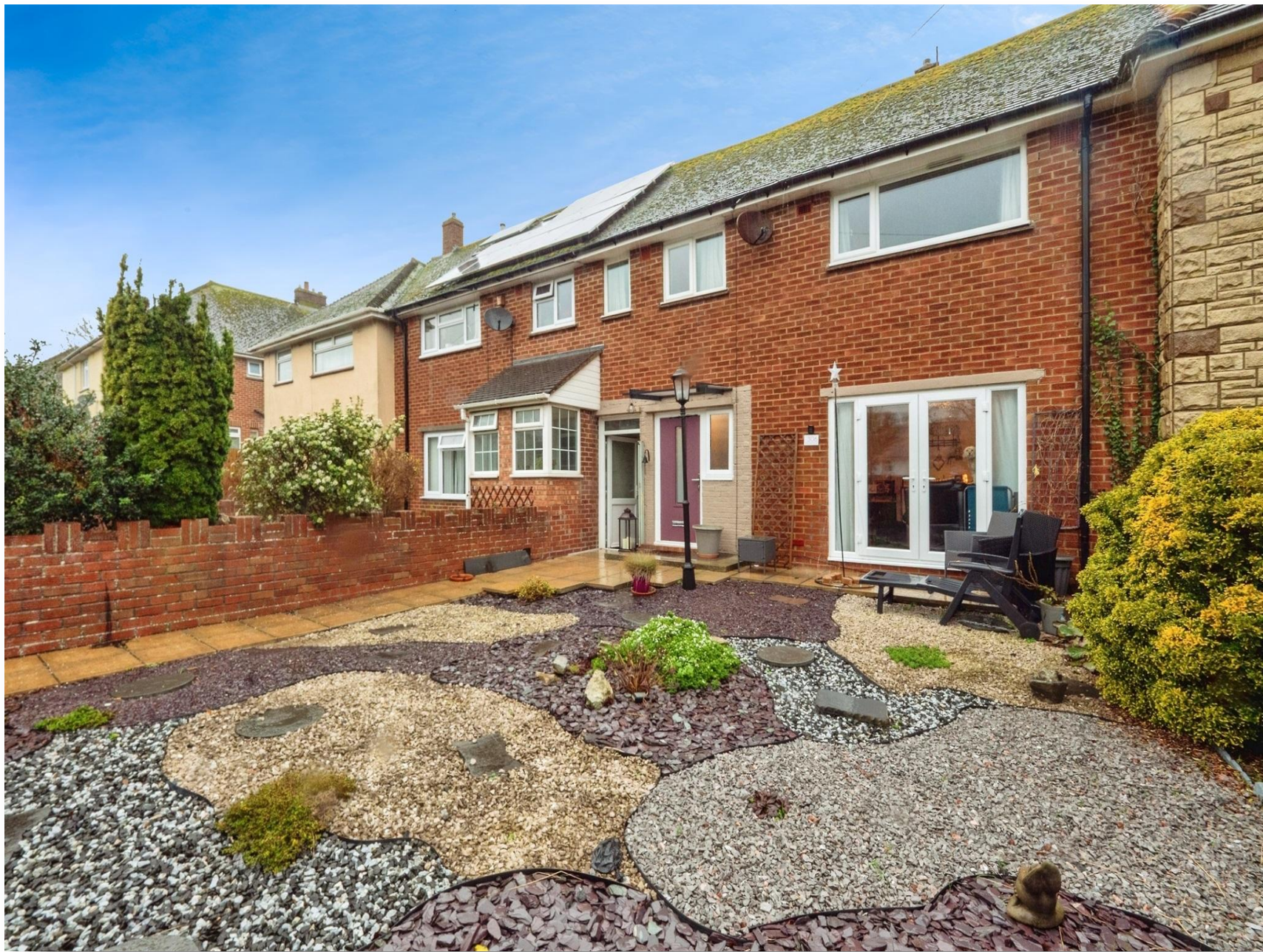
Chickerell Road, Weymouth, DT4 0RD