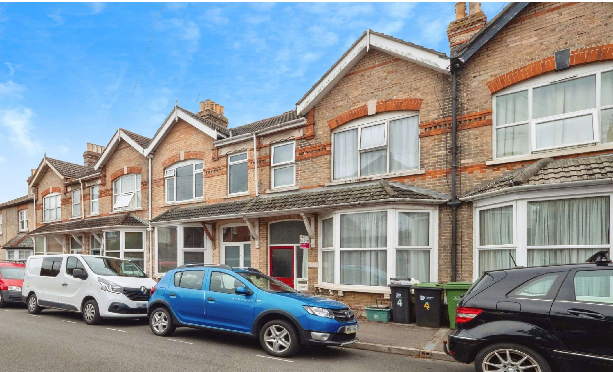
Cassiobury Road, Weymouth, DT4 7JN