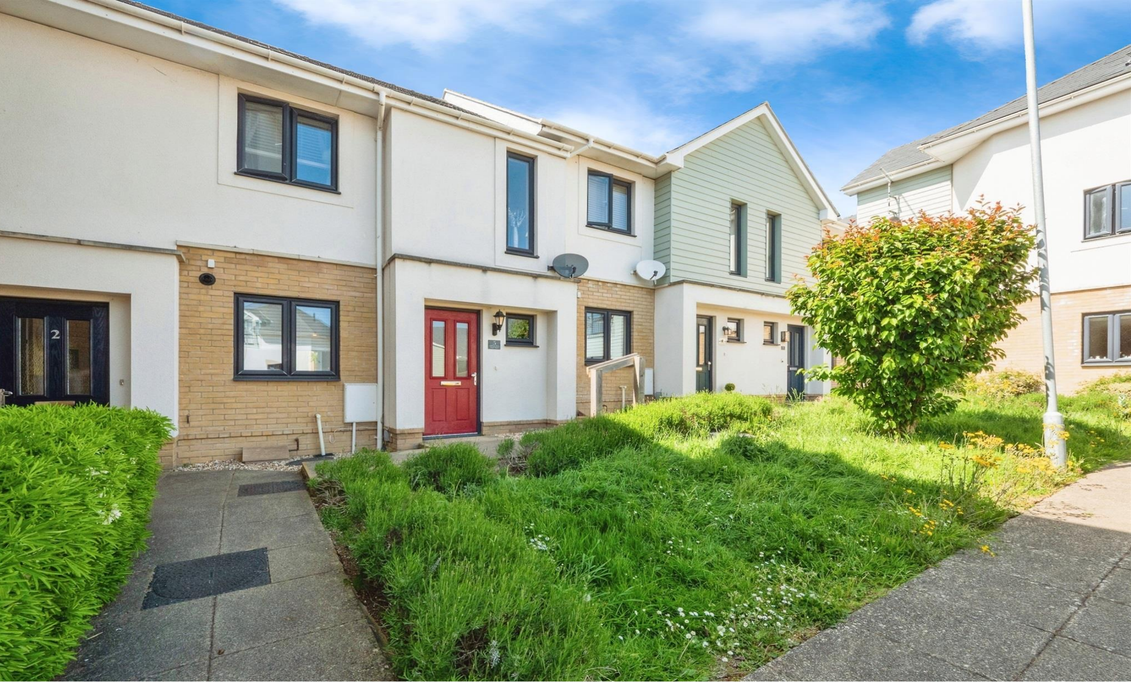
Addison Mews, Weymouth, DT3 6FL