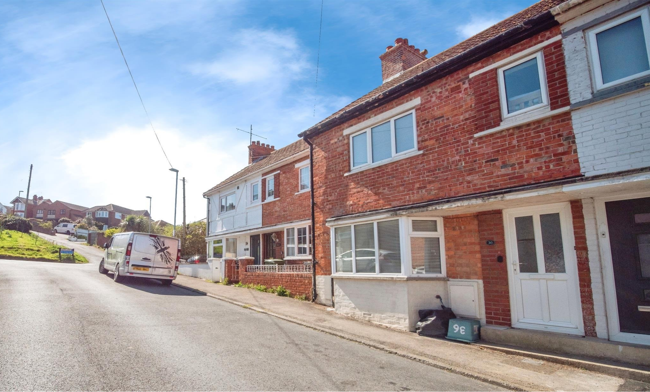
Prince Of Wales Road, Weymouth, DT4 0BY